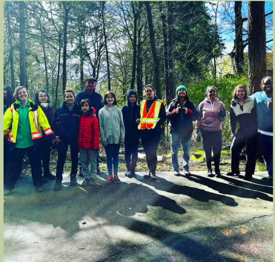
Invasive Pull Event, April 2023