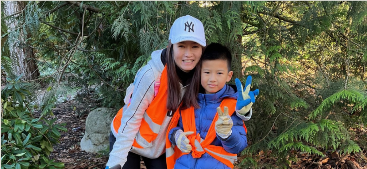
Volunteers at Invasive Pull Event, Nov 2022