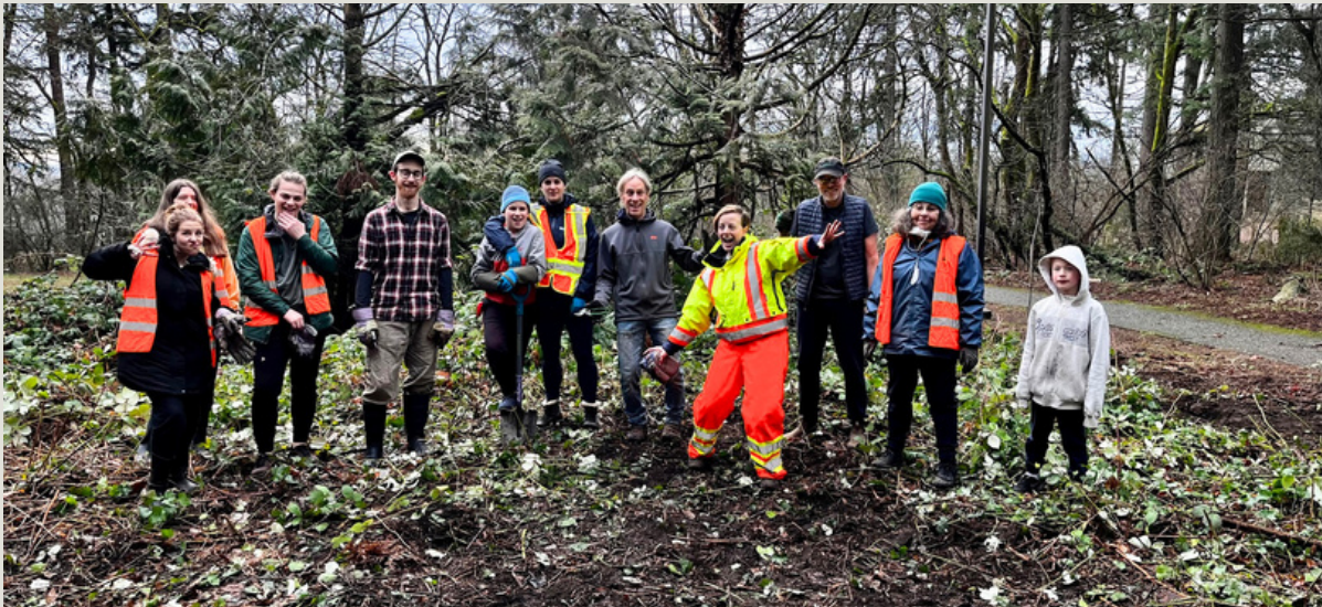
Dedicated volunteers at Invasive Pull Event, Feb 2023