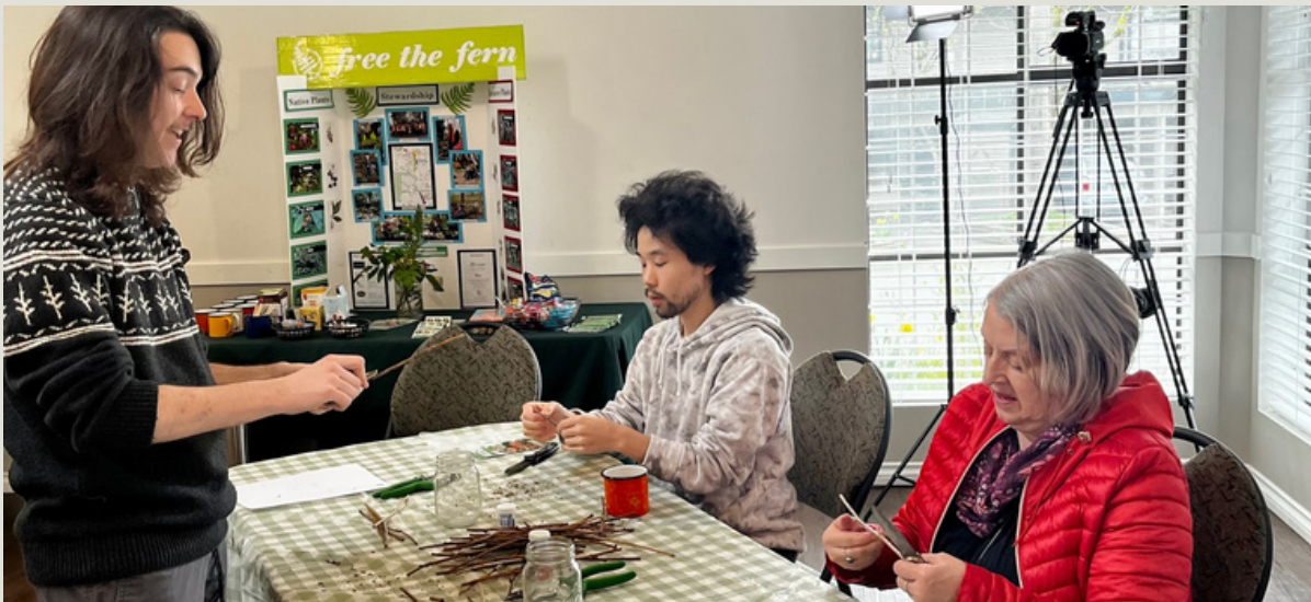
Bird Nesting Cage Workshop, April 2023