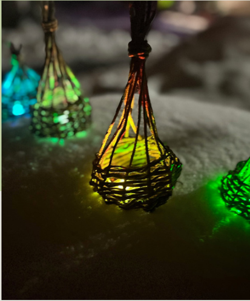
Ivy Lanterns by Artist, Joe Boyd