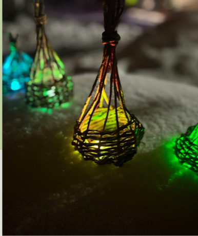
Ivy Lanterns by Artist, Joe Boyd