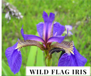
WILD FLAG IRIS