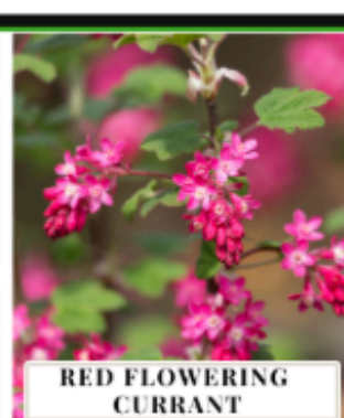
RED FLOWERING CURRANT